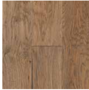
SALOON HICKORY MED03-53