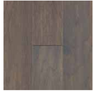
MOONSHINE HICKORY MED03-54