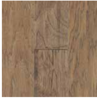
DUSTY PATH HICKORY MED03-52