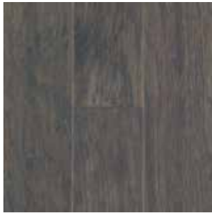
WAGON HICKORY MED03-55