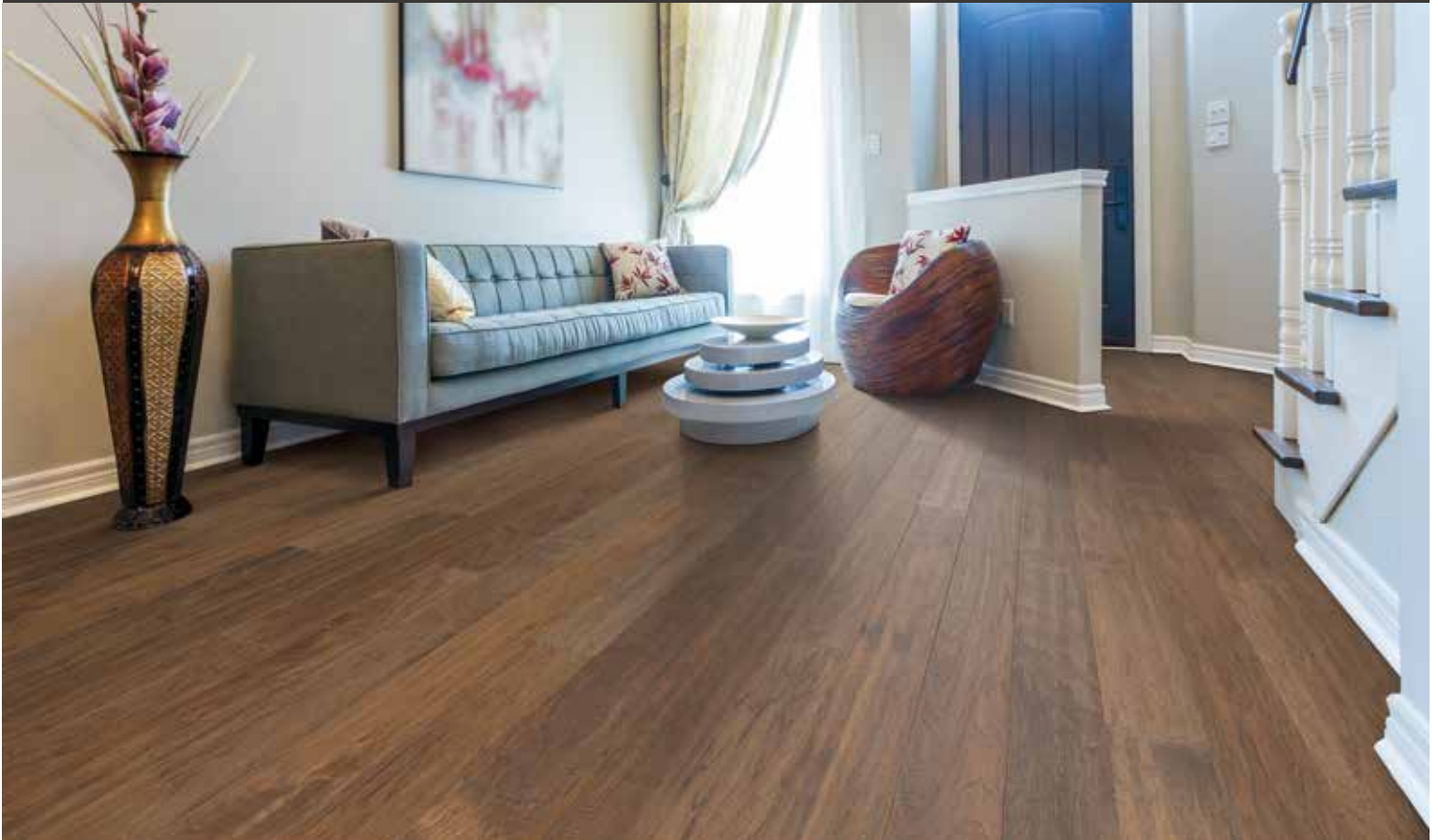
Cover: MOONSHINE HICKORY MED03-54 Above: DUSTY PATH HICKORY MED03-52