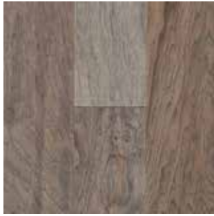
WOODWIND HICKORY MED03-51