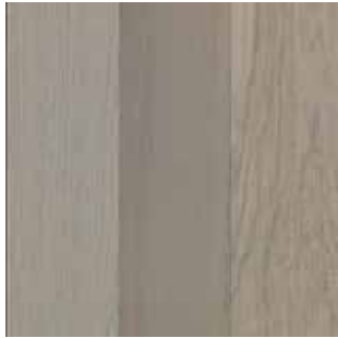
HEARTHSTONE OAK WEC91-69