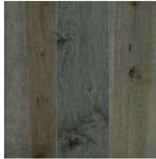
CASTLEROCK MAPLE WEC91-72