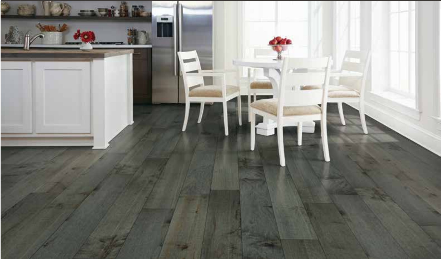
Cover: GUNMETAL OAK WEC91-70