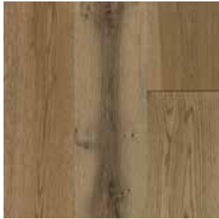
STUDIO OAK MEM04-60