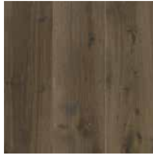
COFFEEHOUSE OAK MEM04-62