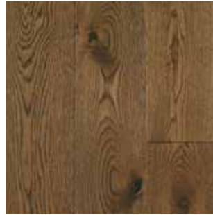
MIDTOWN OAK MEM04-58