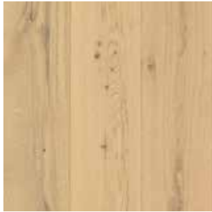
TAPESTRY OAK MEM04-56