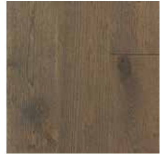
NIGHTFALL OAK MEM04-59