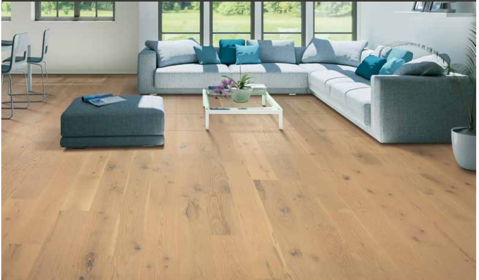
Cover: CITY LOFT OAK MEM04-61