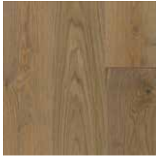
CITY LOFT OAK MEM04-61