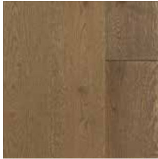
BROWNSTONE OAK MEM04-57