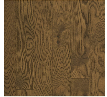
URBAN BRONZE OAK | 851