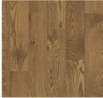
DAVENPORT TAN OAK | 838