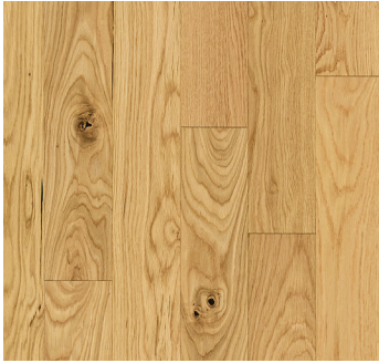
NATURAL OAK | 131