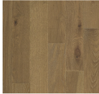
TUNGSTEN OAK | 946