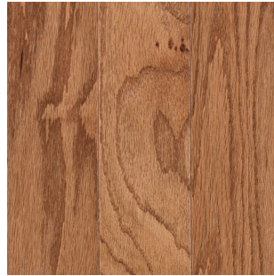
OAK GOLDEN WEC29 - 20