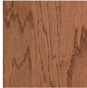
OAK AUTUMN WEC29 - 30