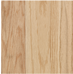
RED OAK NATURAL WEC29 - 10