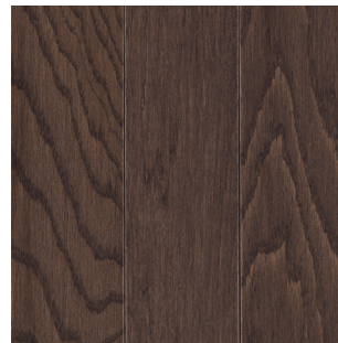
STONEWASH OAK WEC29 - 17