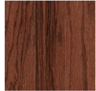
OAK CHERRY WEC29 - 42