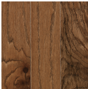
OAK OXFORD WEC29 - 52