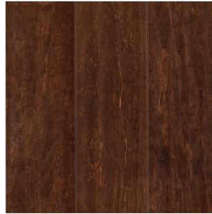
RUSTIC TOBACCO MEC94-98