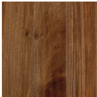
TOASTED OAT MEC94-56