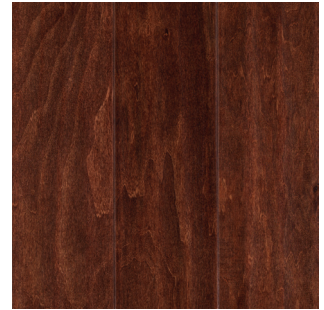
AUTUMN RUSSET MEC94-40