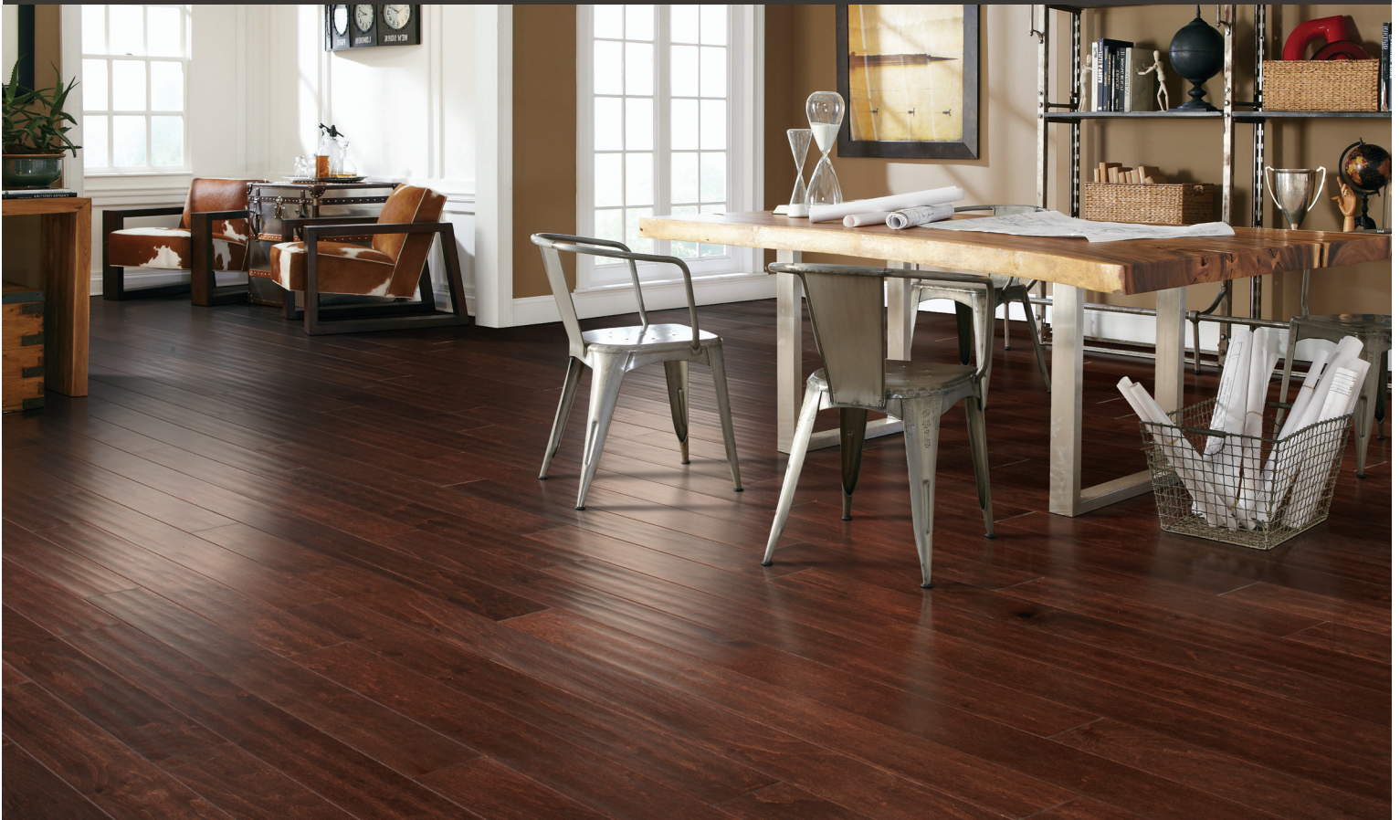
Cover: AMBER SIENNA MEC94-99