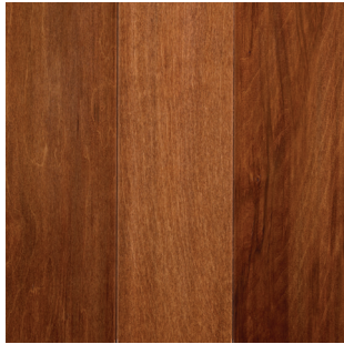
AMBER SIENNA MEC94-99