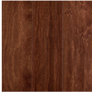
TERRACE BROWN MEC94-11