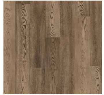
BEAUMONT | 406