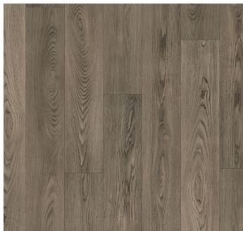
FERNBROOK | 407