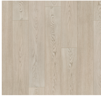
PIPER | 404