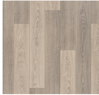
MONET | 405