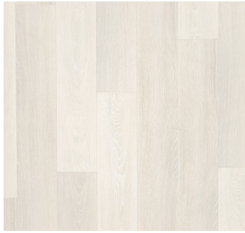
CHANTILLY | 403

The highest level of Signature™ texture, definition, and color detail.