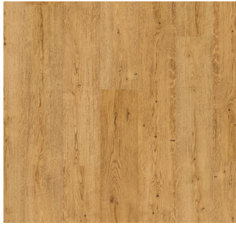
WESTERLY | 411

The highest level of Signature™ texture, definition, and color detail.