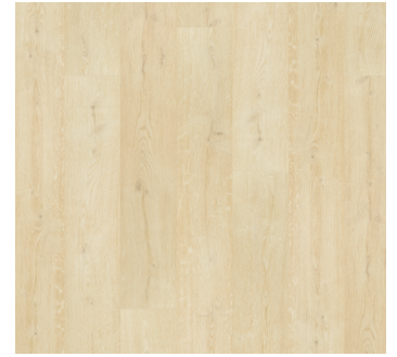
SEABROOK | 408