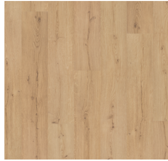
RYDER | 409