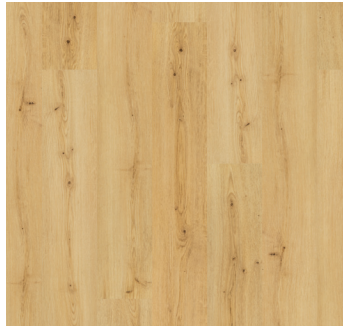
AMELIA | 410