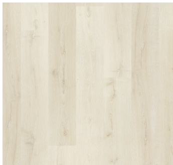
IRIS | 433