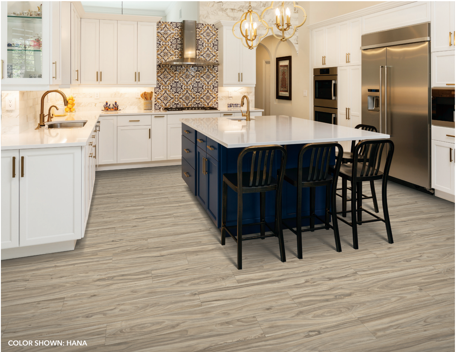
COLOR SHOWN: HANA