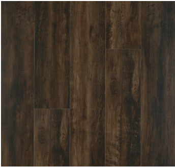
CAFÉ DOPPIO EFS21-890 PLANK VARIATION: 10