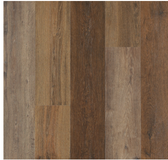
SHADOW WOODLANDS EFS21-822 PLANK VARIATION: 15