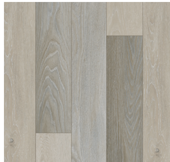
DAZY HAZY EFS21-925 PLANK VARIATION: 10