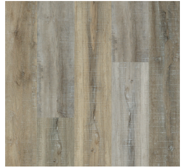
NEW SILHOUETTE EFS21-921 PLANK VARIATION: 15