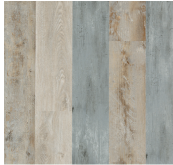
METALLIC SHADOWS EFS21-924 PLANK VARIATION: 15