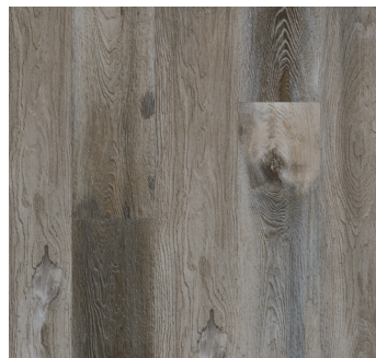
RACCOON EFS21-259 PLANK VARIATION: 10