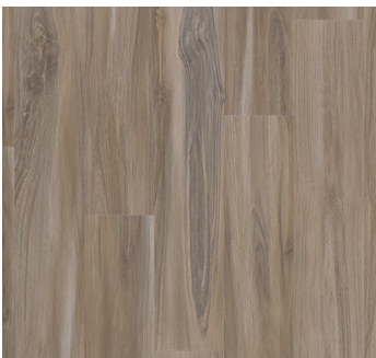
SANDY VALLEY EFS21-382 PLANK VARIATION: 10