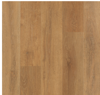
STORMY SANDS EFS21-813 PLANK VARIATION: 10