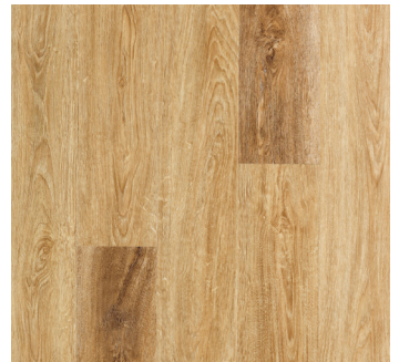
METAL SMOKE EFS21-314 PLANK VARIATION: 10