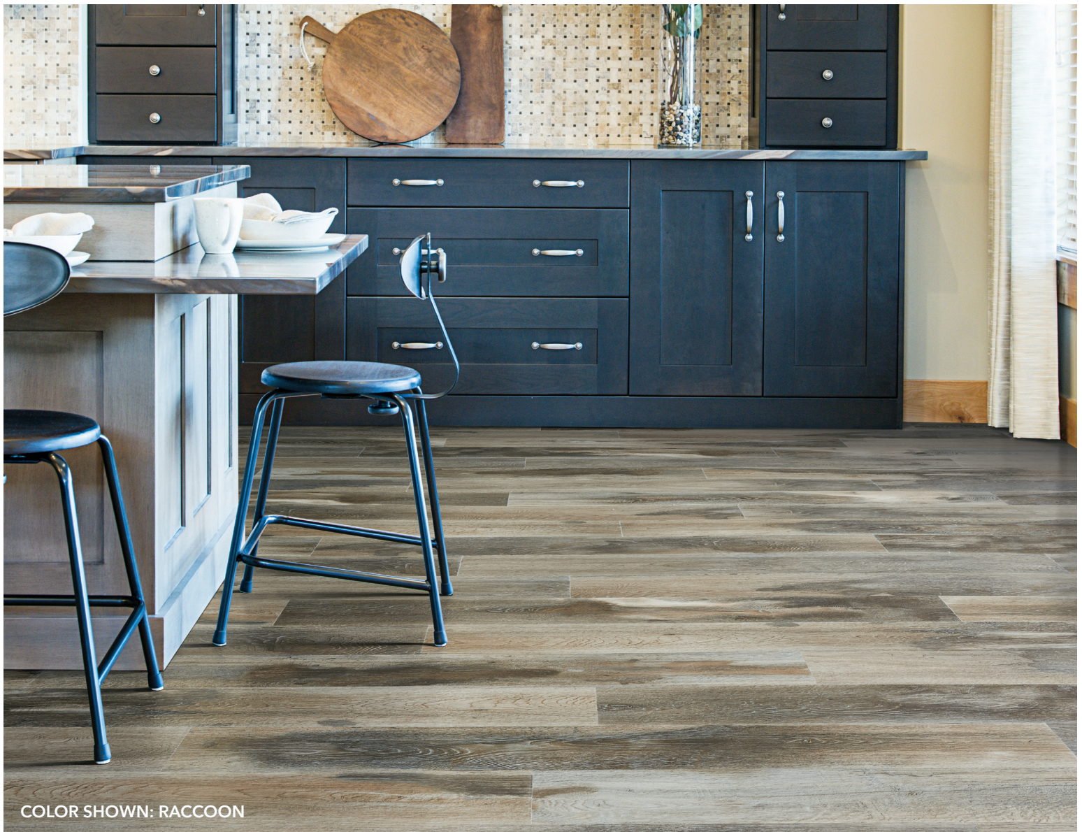
COLOR SHOWN: RACCOON