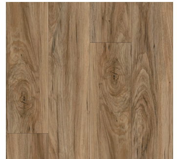
SEASIDE SPARROW PINE 849