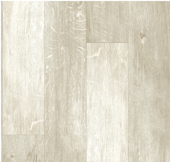
WARBLER OAK 360