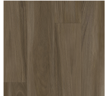
SAVANNAH SPARROW PINE 875