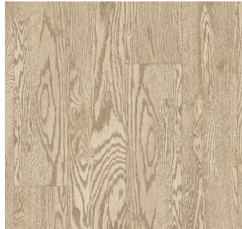
CROWNED KINGLET OAK 220