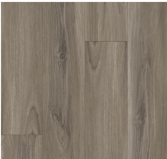
WAXWING PINE 962