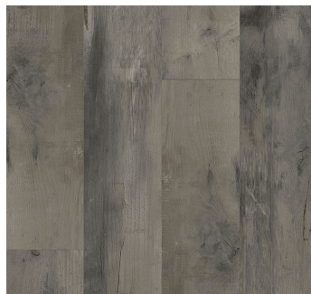
CARACARA PINE 998