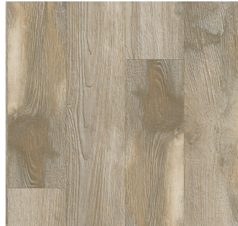
SEdge WREN OAK 259