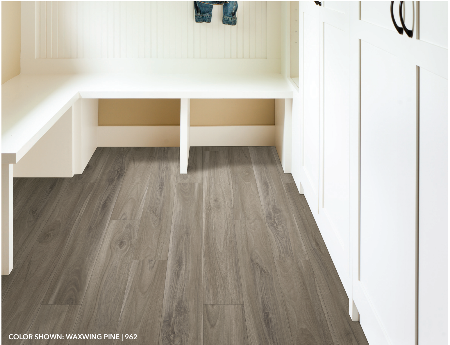
COLOR SHOWN: WAXWING PINE | 962