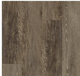
FOX SPARROW OAK 892