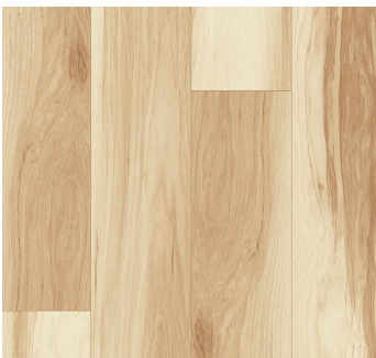
SUNSET GULL PINE 310