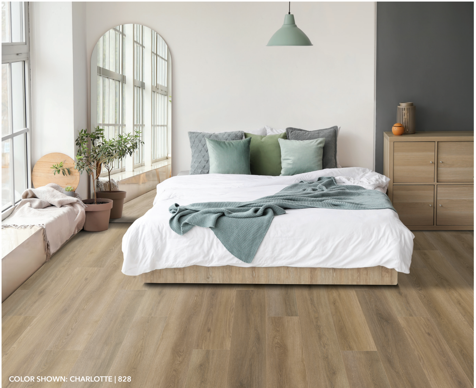
COLOR SHOWN: CHARLOTTE | 828