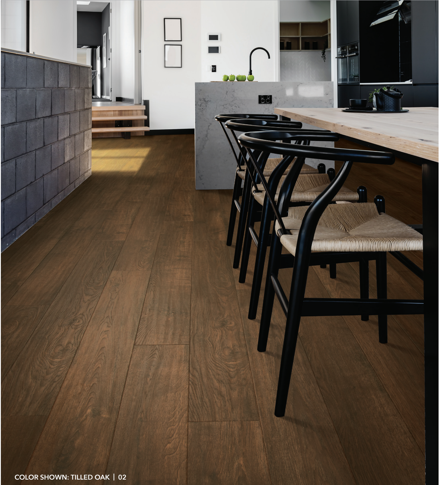
COLOR SHOWN: TILLED OAK | 02