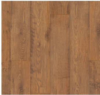
SUN DRIED OAK | 01

Maximum waterproof protection for wet and steam mopping.