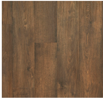
TILLED OAK | 02