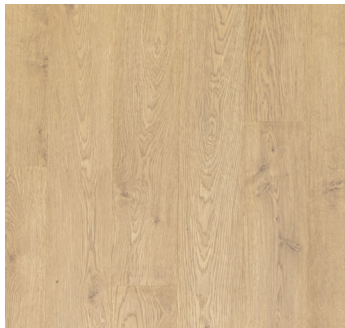
MOUNTAIN LAKE OAK | 05