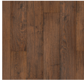
RED CLAY OAK | 03