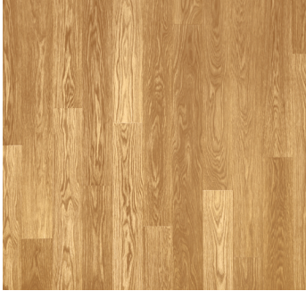
TENNESSEE RYE OAK | 01

Maximum waterproof protection for wet and steam mopping.