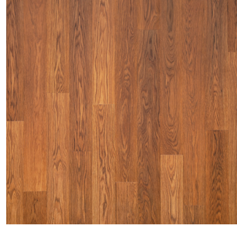
SMOOTH AMBER OAK | 03