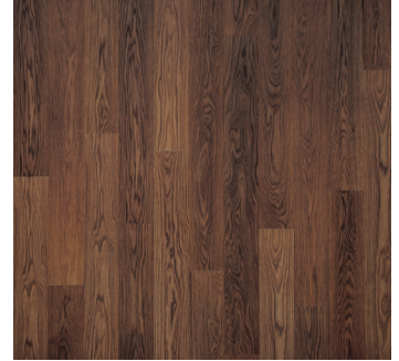
RICH BARREL OAK | 04