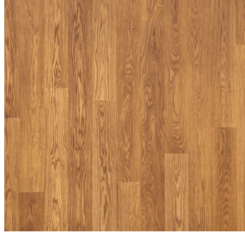
MALTED BARLEY OAK | 02