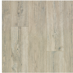
COUNTRY LINEN OAK CDL94-02