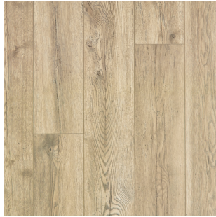
CANVAS OAK CDL94-01