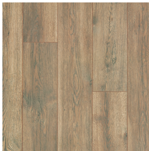
BURNISHED CLAY OAK CDL94-05