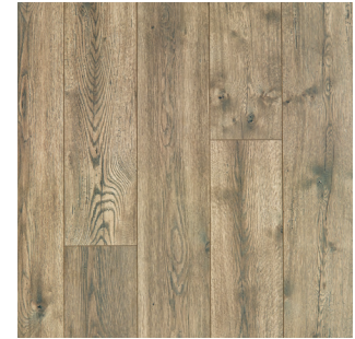
GILDED OAK CDL94-04