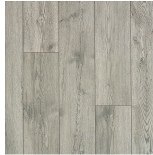
WINDSMOKE OAK CDL94-03