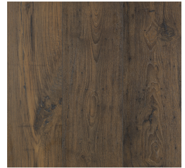
EARTHEN CHESTNUT | 04W*