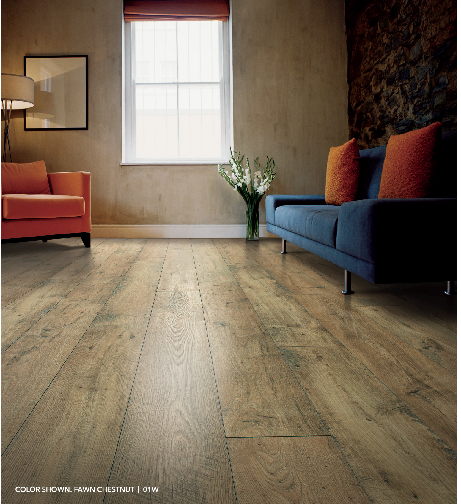
COLOR SHOWN: FAWN CHESTNUT | 01W