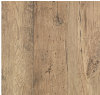
FAWN CHESTNUT | 01W*

Covers all pets, all accidents, all the time.