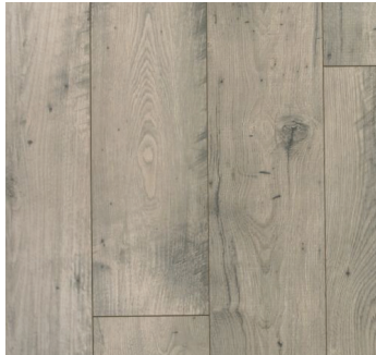
SILVERSTONE CHESTNUT | 07W*