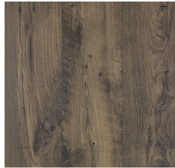
KNOTTED CHESTNUT | 03W*