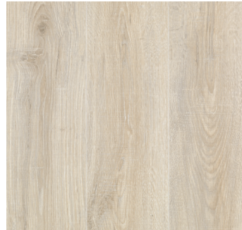
SANDCASTLE OAK | 05W**