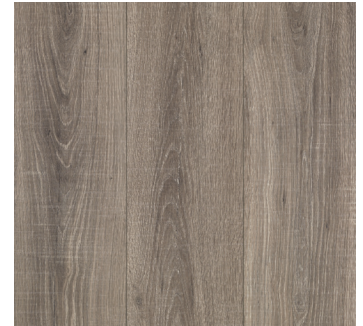
DRIFTWOOD OAK | 06W**