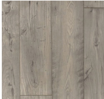
DOESKIN CHESTNUT | 08W*