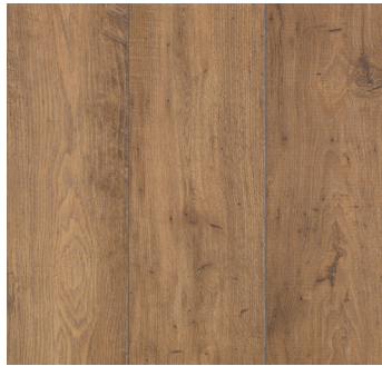
CEDAR CHESTNUT | 02W*