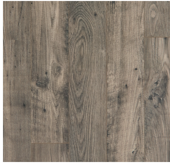
MILLSTONE CHESTNUT | 06