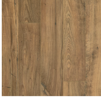
TOASTED CHESTNUT | 02