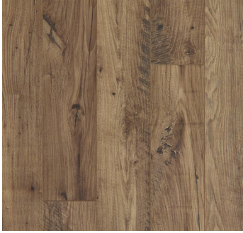
NUTMEG CHESTNUT | 01