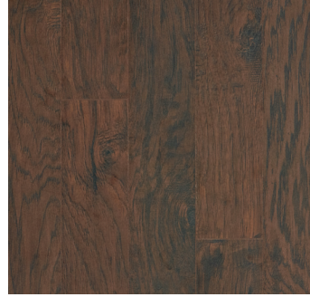
BOURBON HICKORY | 03