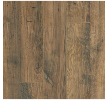
BROWNSTONE CHESTNUT | 07