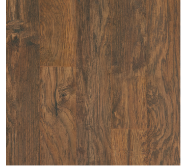
RUSTIC SUEDE HICKORY | 04