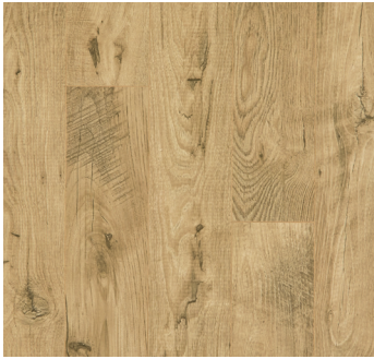
RUSTIC RYE CHESTNUT | 05