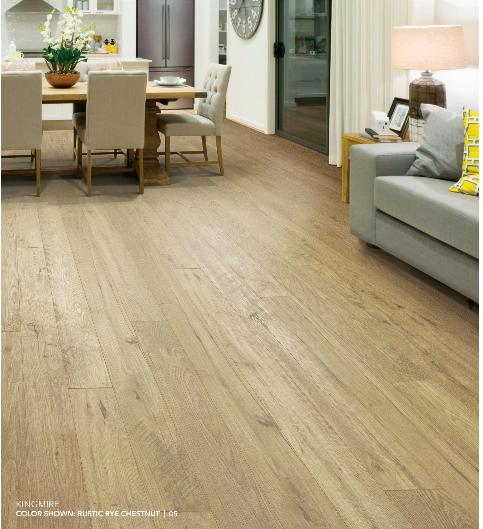
KINGMIRE COLOR SHOWN: RUSTIC RYE CHESTNUT | 05