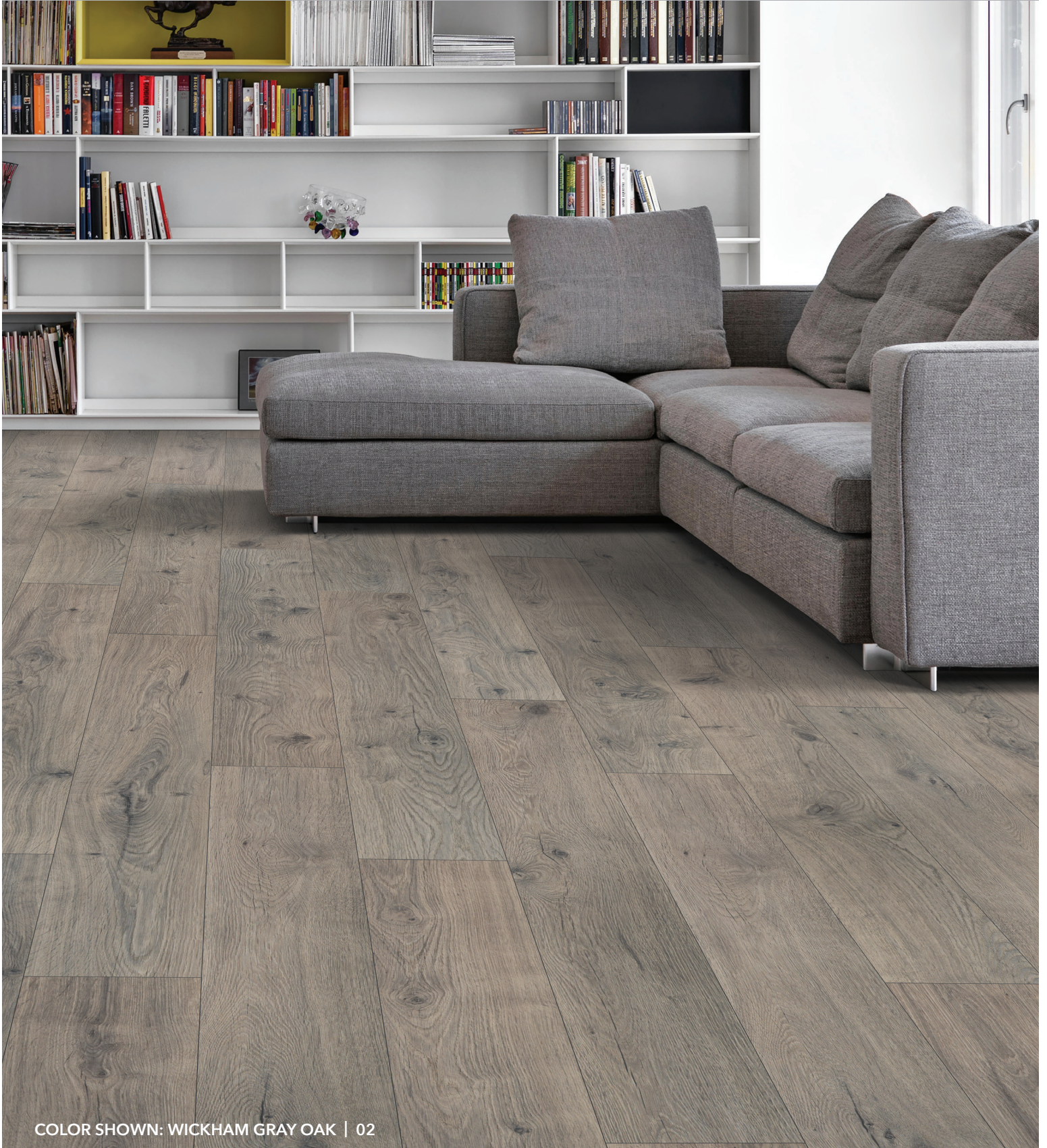
COLOR SHOWN: WICKHAM GRAY OAK | 02