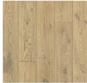
ALMONDINE OAK | 03 TEXTURE | ALLOVER