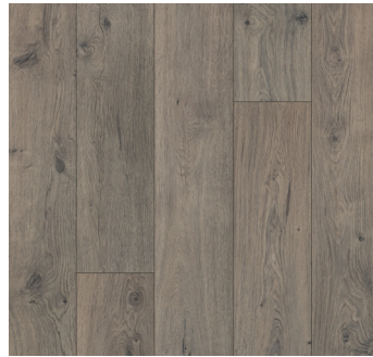
WICKHAM GRAY OAK | 02 TEXTURE | EIR