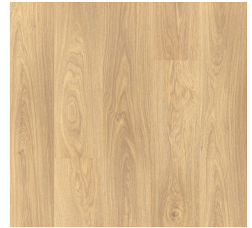
ACADIA OAK | 04 TEXTURE | ALLOVER