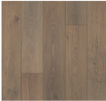
LIGHT TRUFFLE OAK | 01 TEXTURE | ALLOVER

Covers all pets, all accidents, all the time.