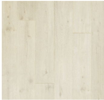
KHAKI OAK | 02