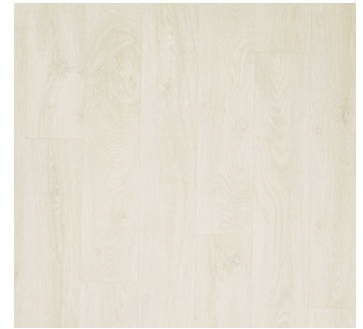
WHITE SATIN OAK | 03