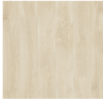
PUMICE OAK | 03