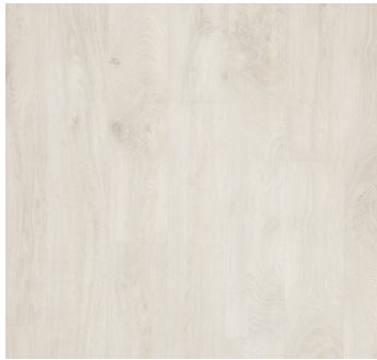
HEIRLOOM OAK | 01

Maximum waterproof protection for wet and steam mopping.