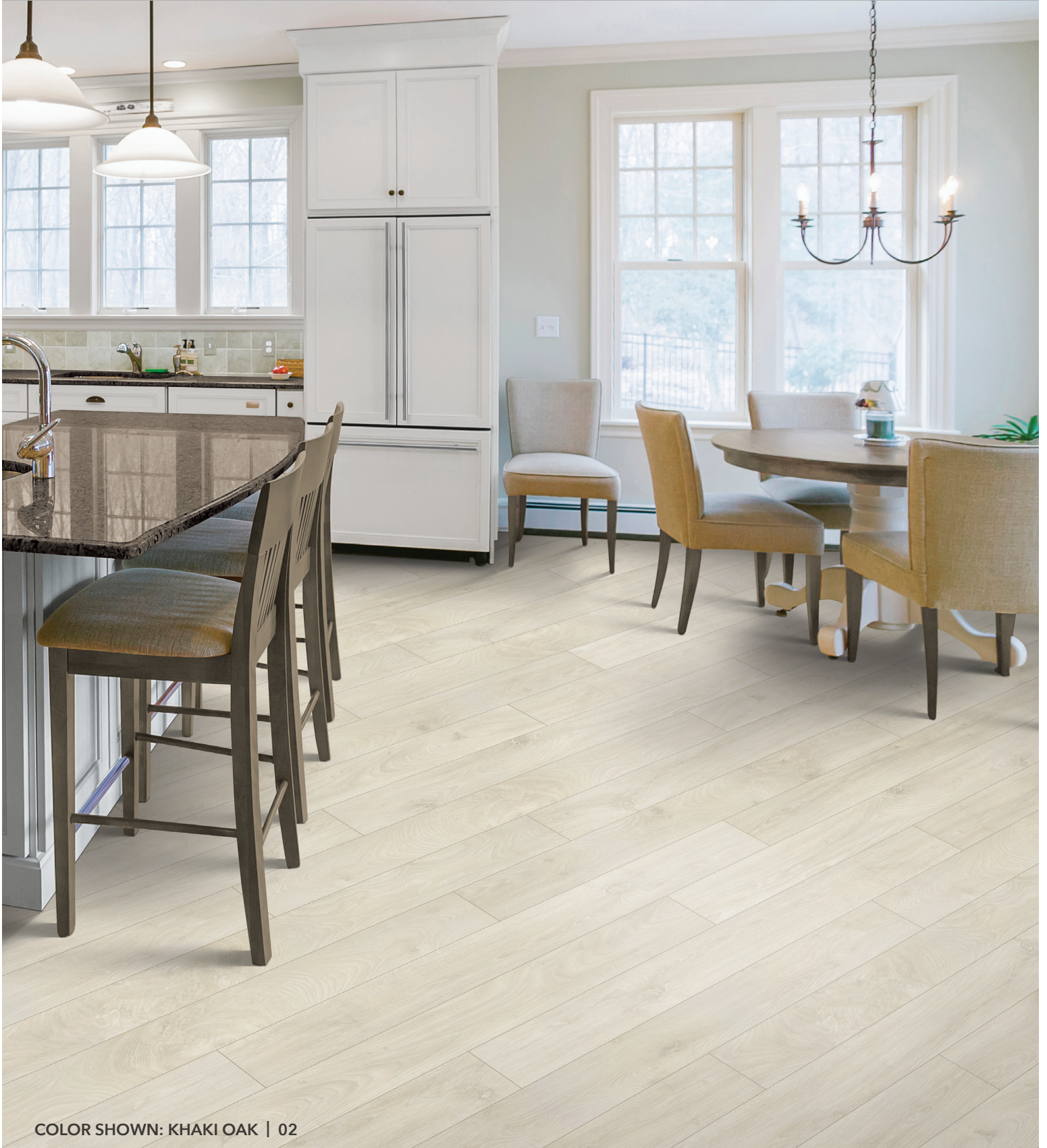
COLOR SHOWN: KHAKI OAK | 02