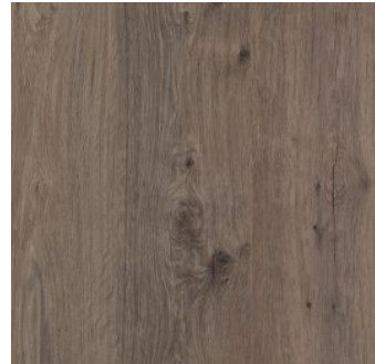
PEARL PLATINUM OAK CDL11-14