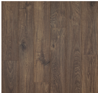
RUSTIC FOREST OAK | 05