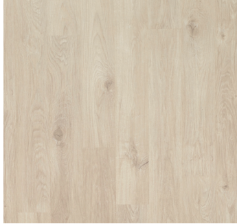
NIMBUS OAK | 01

Maximum waterproof protection for wet and steam mopping.