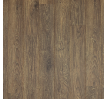
COTTONWOOD OAK | 03