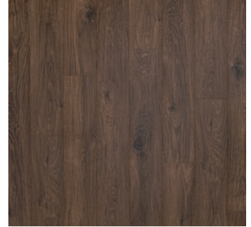
MASON RIDGE OAK | 04