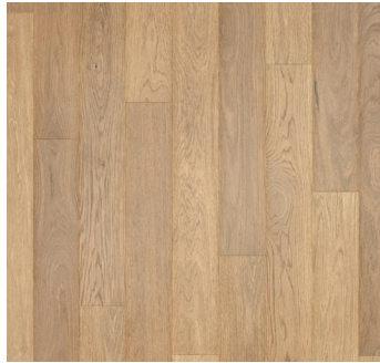
TOASTED TIMBER OAK | 02