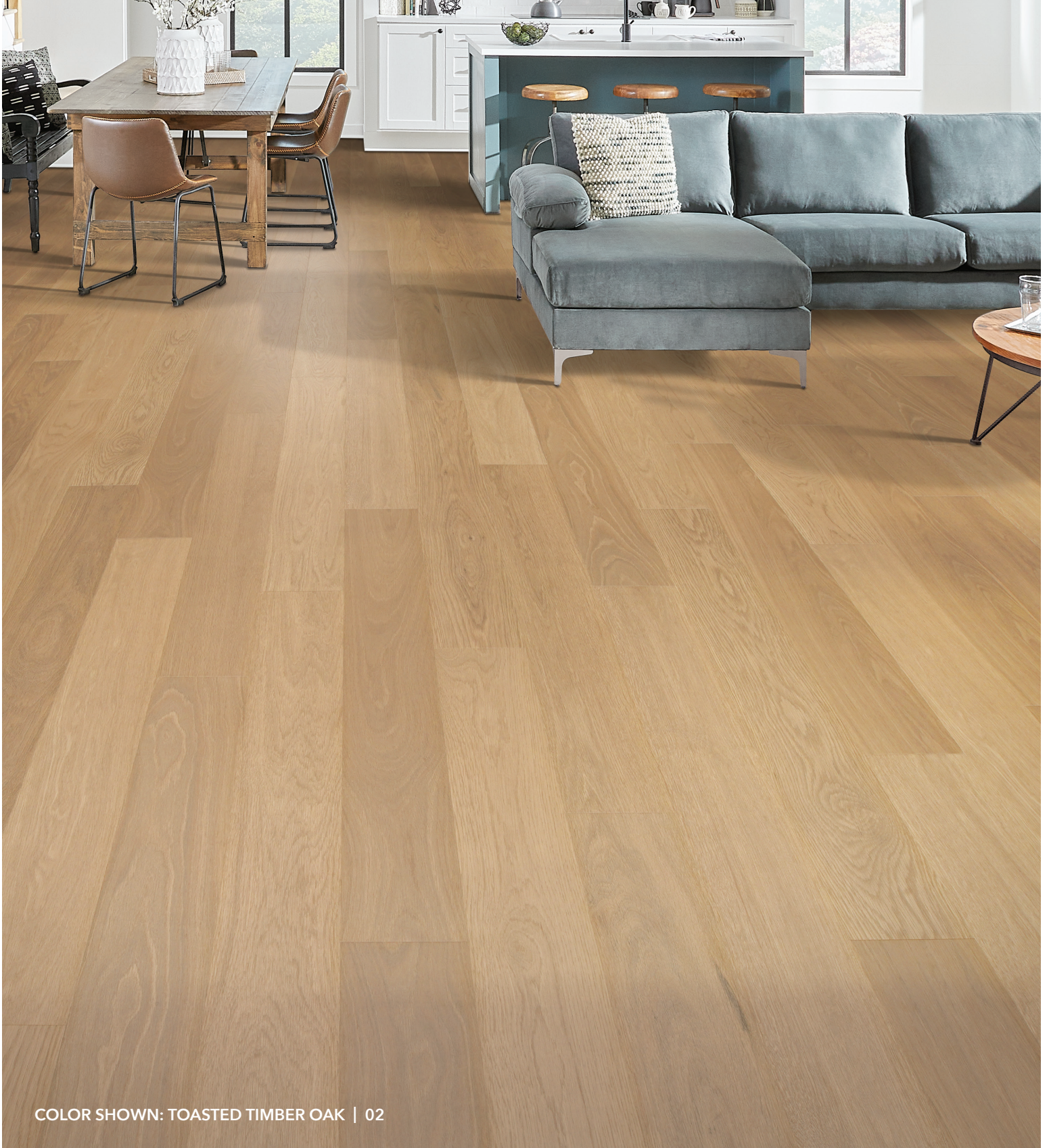
COLOR SHOWN: TOASTED TIMBER OAK | 02