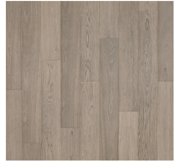
STONE'S THROW OAK | 04