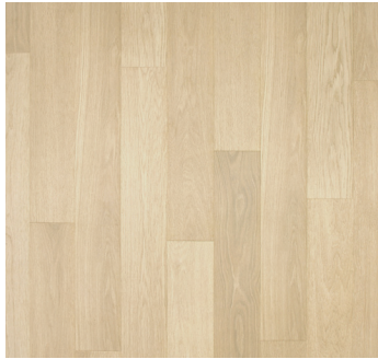
PALE OAK | 01

Maximum waterproof protection for wet and steam mopping.