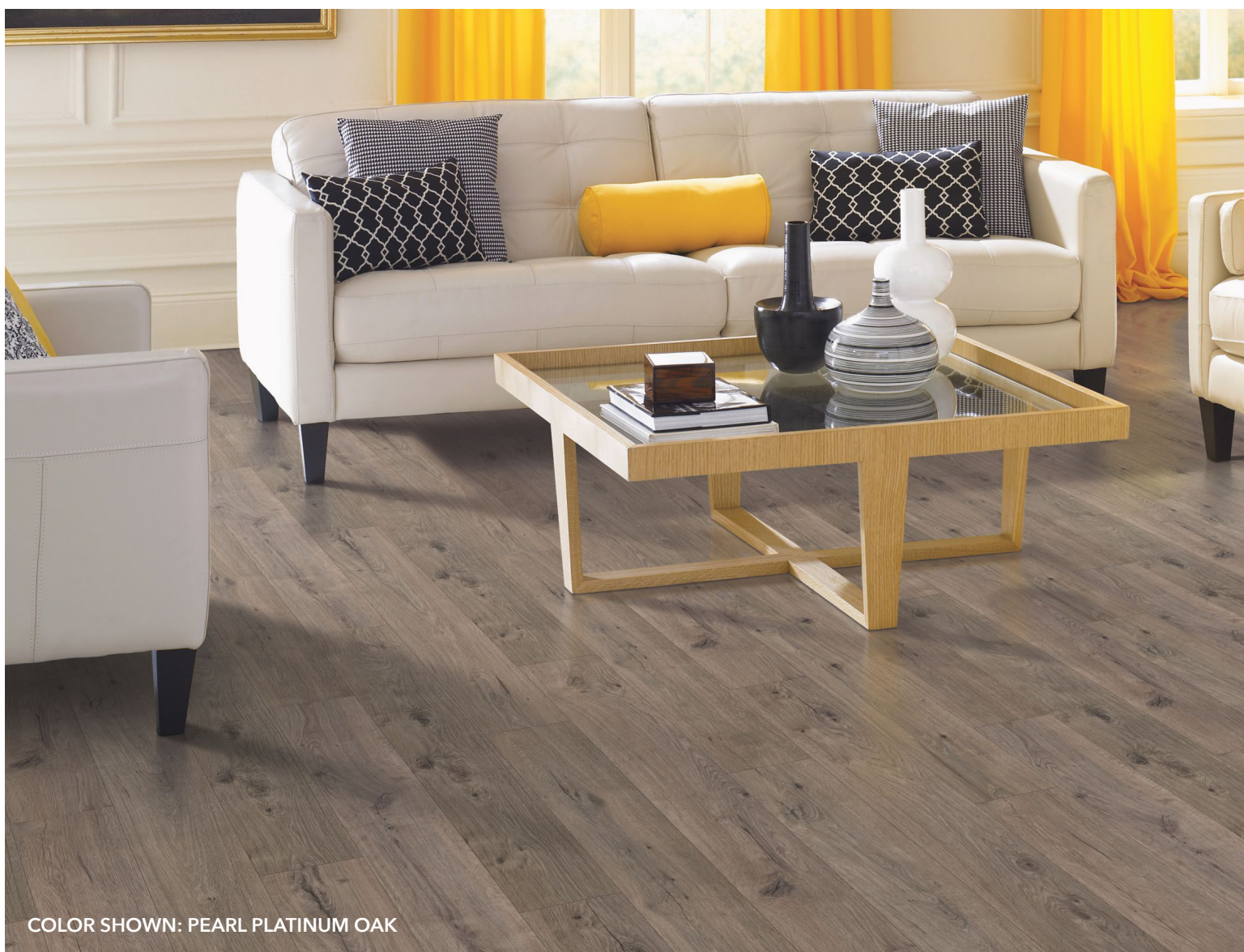
COLOR SHOWN: PEARL PLATINUM OAK

PREMIUM HARDWOOD VISUALS MAXIMUM SCRATCH PROTECTION FADE RESISTANT