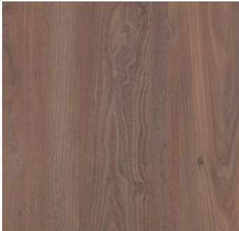
CAFE CHIC WALNUT PLANK CAD11-11