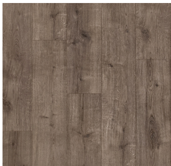
OYSTER OAK | 239