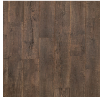
TOASTED ALMOND OAK | 368