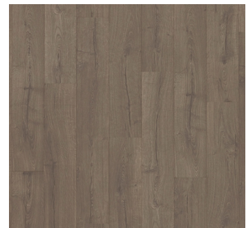
RIVER ROCK OAK | 248