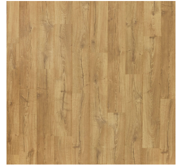
HONEY OAK | 528