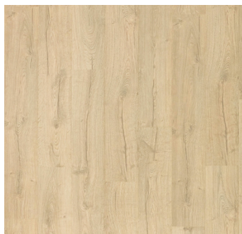
BLOND OAK | 448