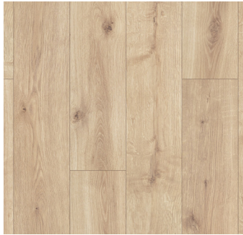
BARLEY OAK | 428

Covers all pets, all accidents, all the time.