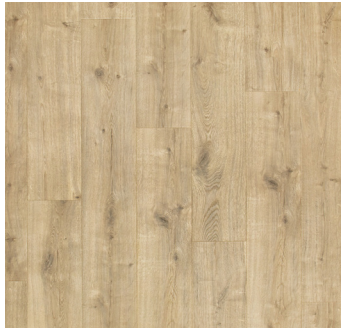
FRESH GRAIN OAK | 328