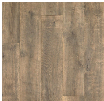
WEATHERED BARN OAK | 348