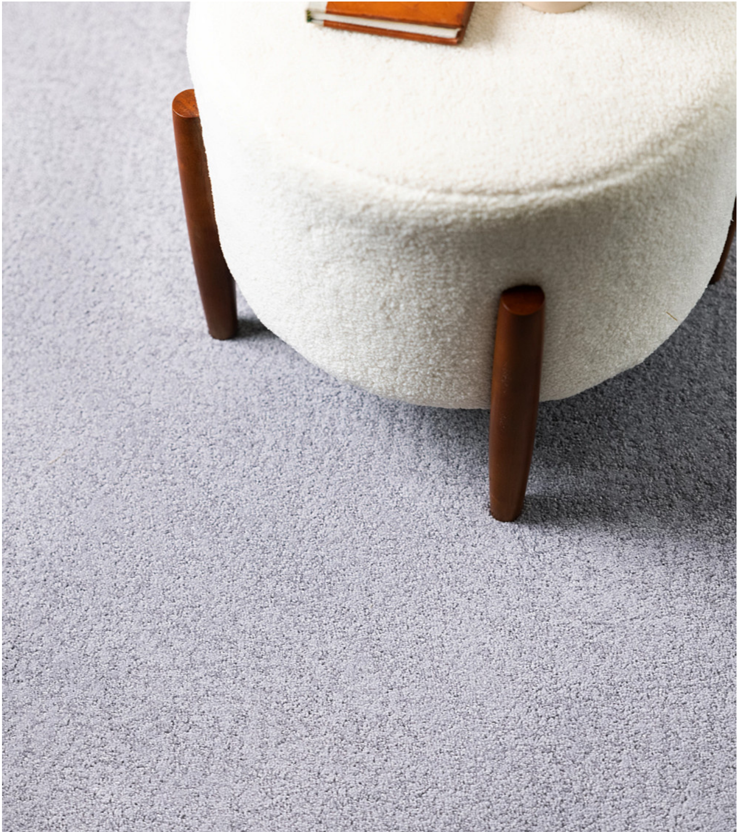
902 Deep Connection