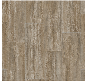
ANCIENT REVIVAL EP002-534 39.37" X 39.37" DROP: 19.69"