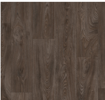
ROASTED MOCHA EP002-858 39.37" X 47.24" DROP: 23.62"