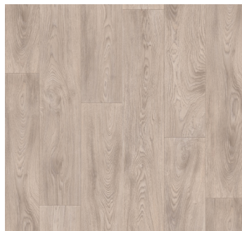
ALMOND LATTE EP002-891 39.17" X 47.24" DROP: 23.62"