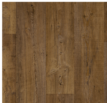
RUSSO EP002-837 47.24" X 39.37" DROP: 23.62"