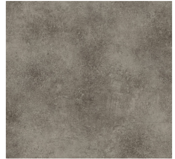
ALDON EP002-581 39.37" X 39.37" DROP: 19.69"