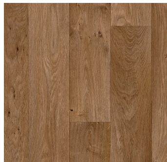
LOMBARDO EP002-843 39.37" X 39.37" DROP: 19.69"