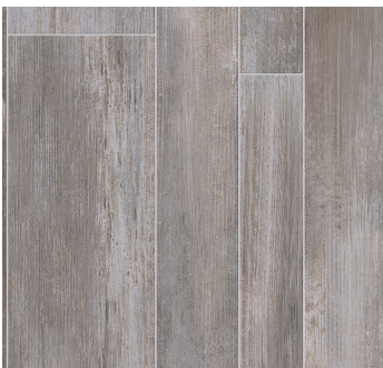
ECLIPSE EP002-595 39.37" X 78.74" DROP: 19.69"