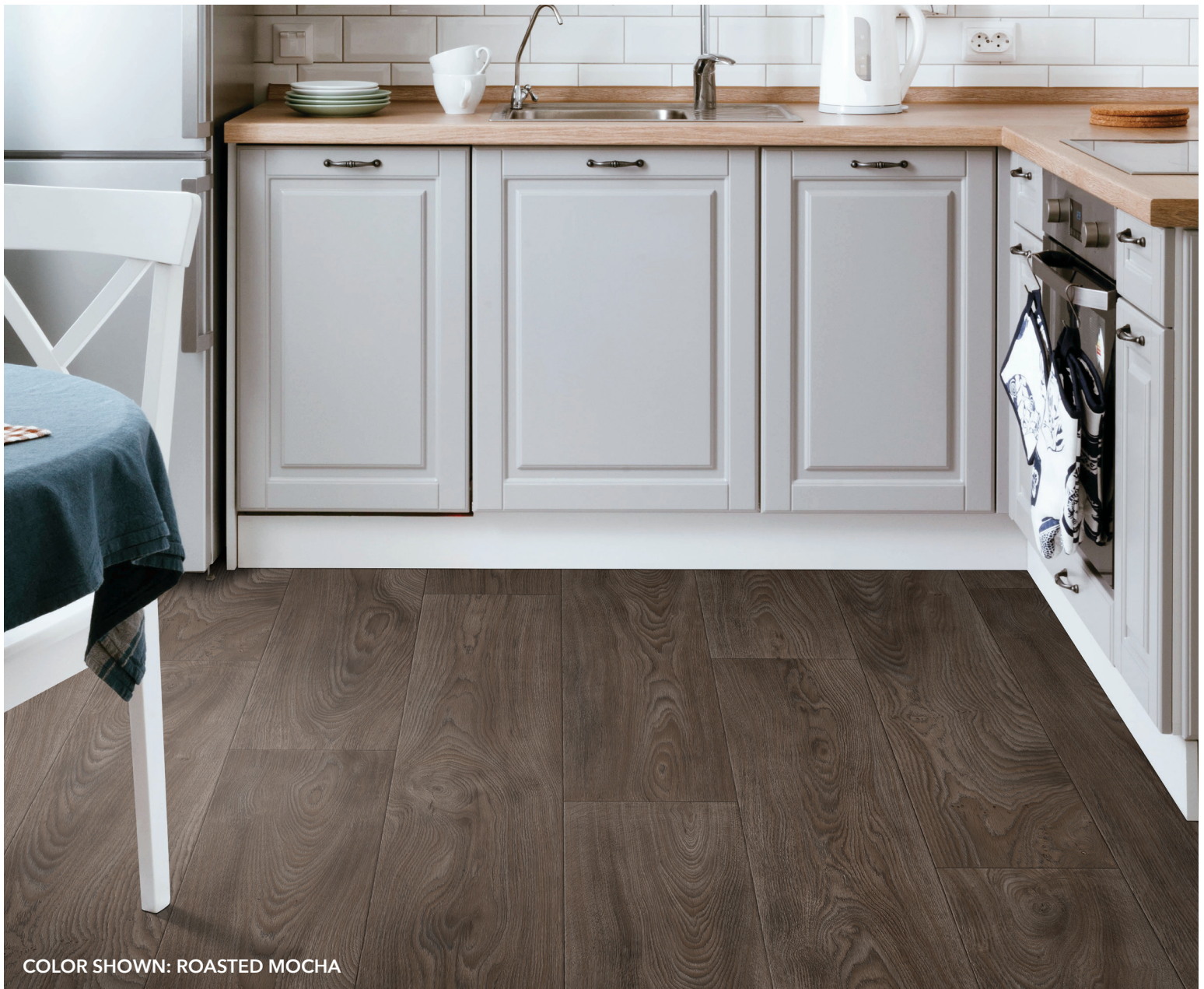
COLOR SHOWN: ROASTED MOCHA