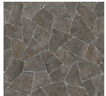
BRECCIA EP002-595A 39.37" X 39.37" DROP: 19.69"