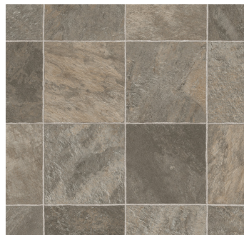
BROWN SUGAR EP002-998 39.37" X 39.17" DROP: 19.69"