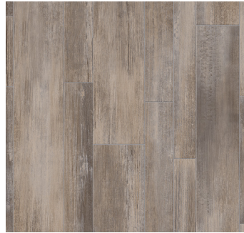
UBER UMBER EP002-545 39.37" X 78.74" DROP: 19.69"