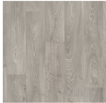
SILVERSMITH F4011-T804 Pattern Repeat: 39.37" x 39.37" Drop: 19.69"