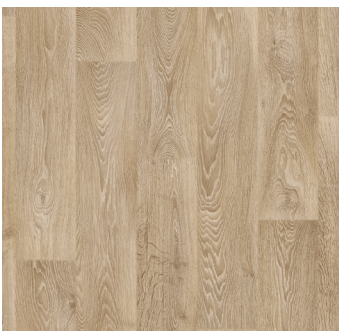
ORIGINAL PRESS F4011-731 Pattern Repeat: 39.17" x 39.37" Drop: 19.69"