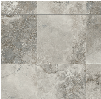
HERITAGE CROSSING F4011-597 Pattern Repeat: 78.74" x 39.37" Drop: 13.12"