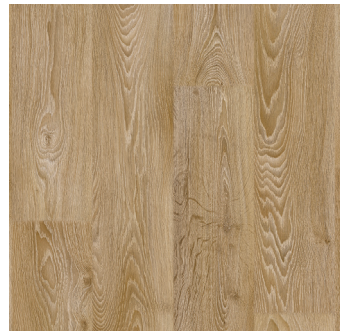
ISLAND SHORE F4011-751 Pattern Repeat: 39.17" x 39.37" Drop: 19.69"