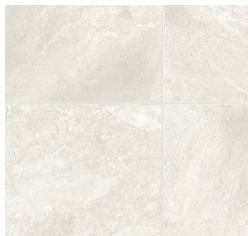
URBAN SWIFT F4011-935 Pattern Repeat: 39.37 x 39.37" Drop: 13.11"