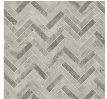
ARTISTIC TOUCH F4011-591A Pattern Repeat: 39.17" x 39.37" Drop: 9.84"