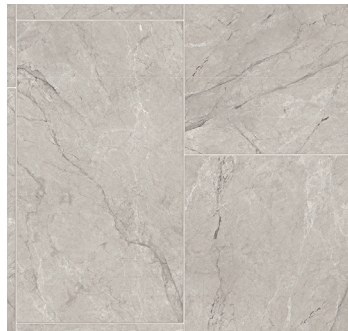
EMMALYN GREY F4011-599A Pattern Repeat: 39.37" x 47.24" Drop: 15.75"