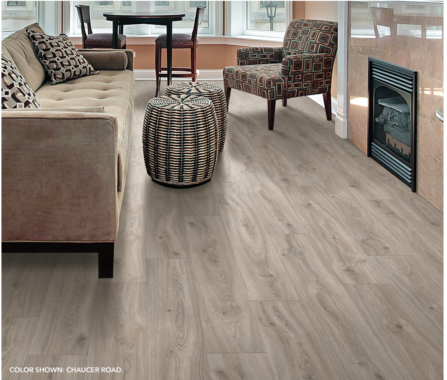
COLOR SHOWN: CHAUCER ROAD