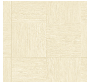
KIRKSTEAD F4011-532 Pattern Repeat: 39.37" x 39.37" Drop: 19.69"