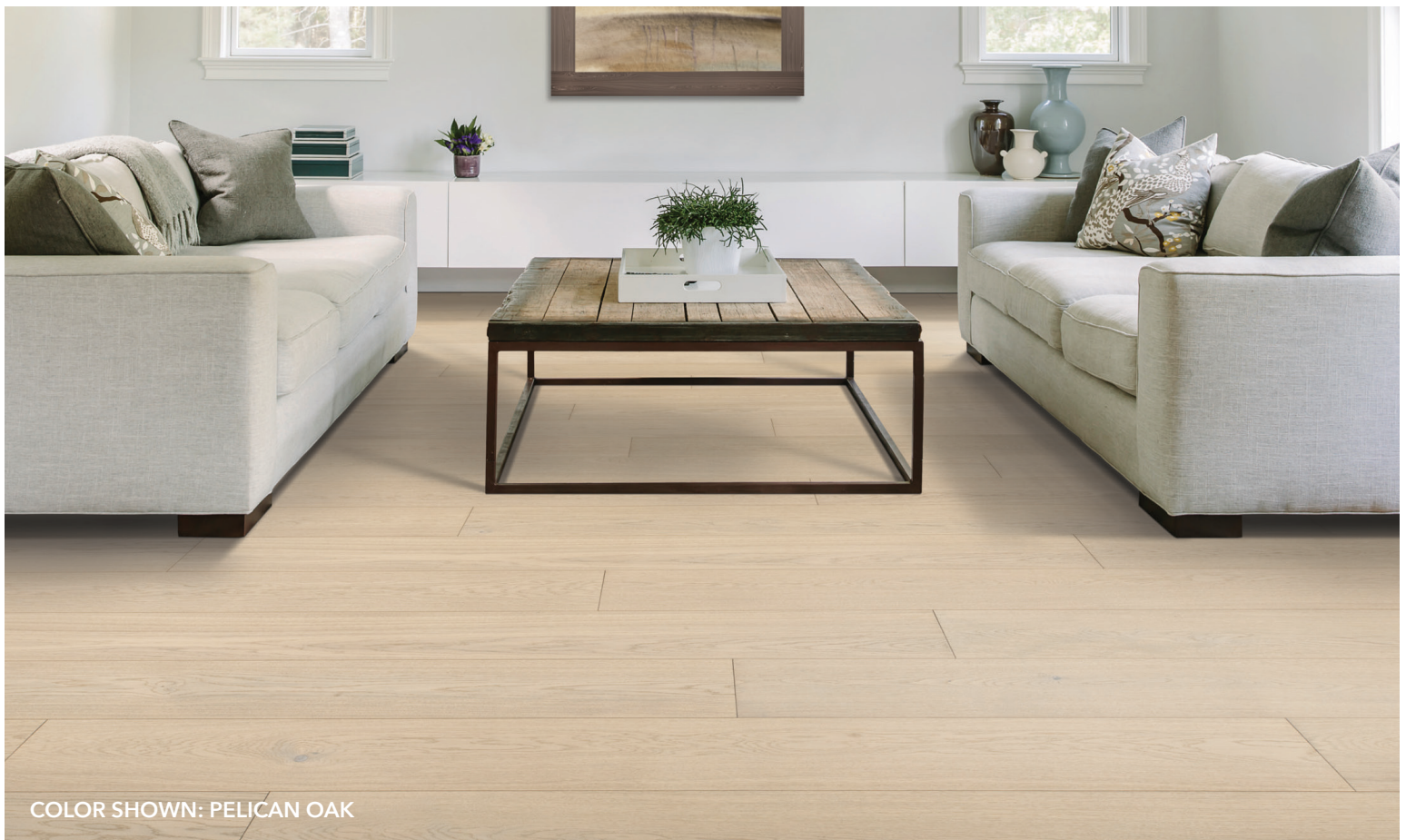
COLOR SHOWN: PELICAN OAK

Limited Lifetime Residential, 5 YR Limited Light to Medium Commercial