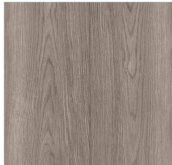
IDA CIRRUS OAK RM905-970