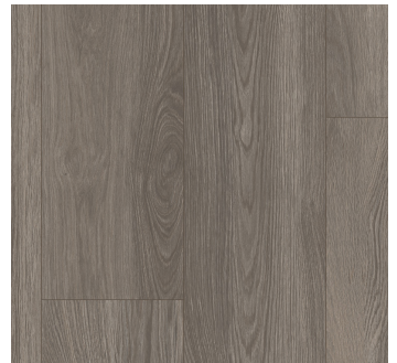
OLD ONYX OAK RM905-977