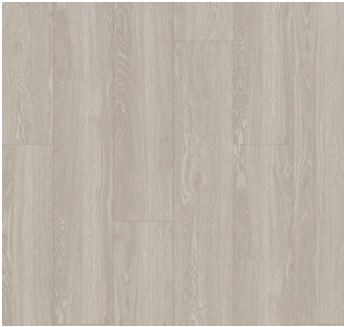
MAKO OAK RM905-170