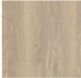
NAUTICA PILING OAK RM905-370