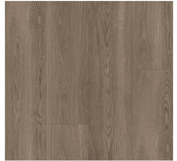
HARBOR STEEL OAK RM905-870