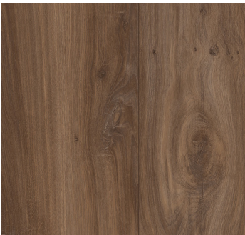
LOGGERHEAD OAK RM905-880