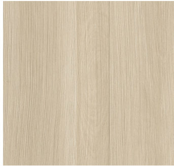
SAND DOLLAR OAK RM905-220