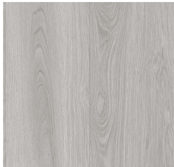
SEA SPRAY OAK RM905-910