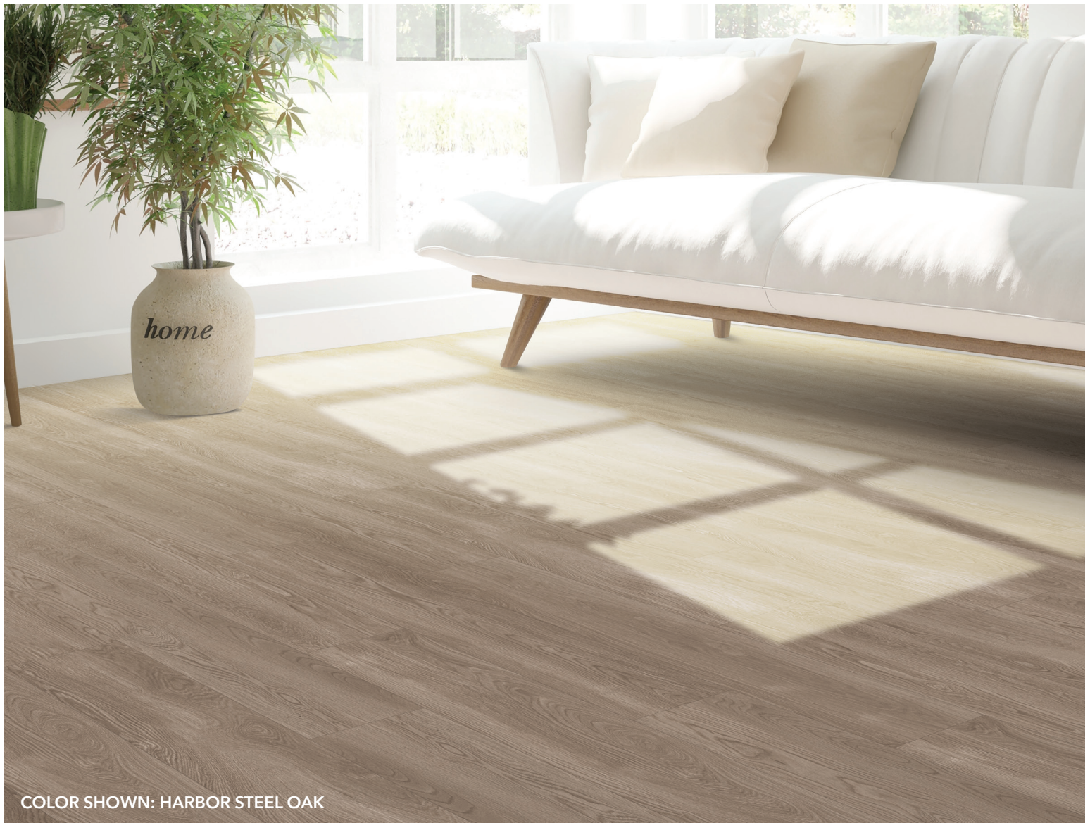
COLOR SHOWN: HARBOR STEEL OAK