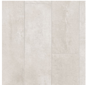
GREY GRANITE FAL24-CT590 39.37" x 39.37" No Drop