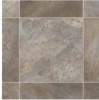
OTTERTAIL FAL24-T994 39.37" x 39.37" Drop: 13.11"