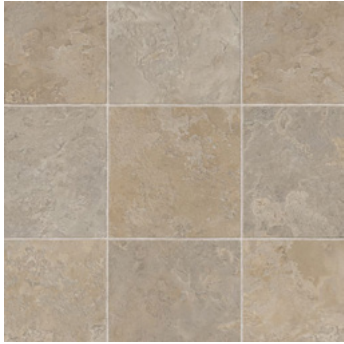
CLAY FAL24-T930 39.37" x 39.37" No Drop