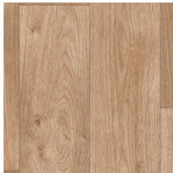
MESA TAN FAL24-TV737 39.37" x 39.17" Drop: 19.69"