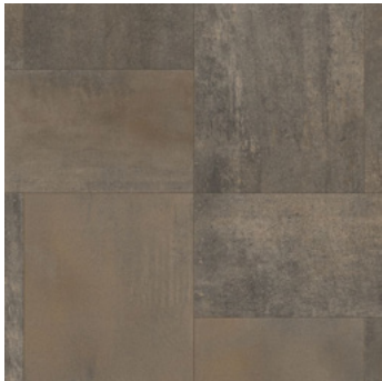
DARK ASH FAL24-RC546 78.74" x 39.37" Drop: 19.69"