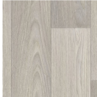
SILVER STRAND FAL24-MC791 39.37" x 39.17" Drop: 19.69"