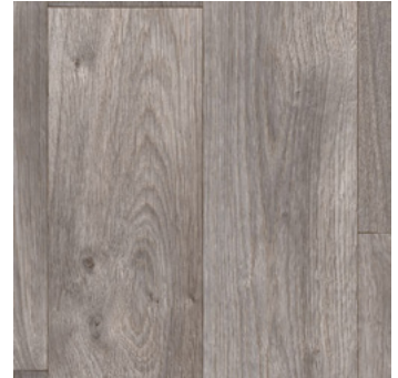
MOUNTAIN GREY FAL24-TV796 39.37" x 39.17" Drop: 19.69"