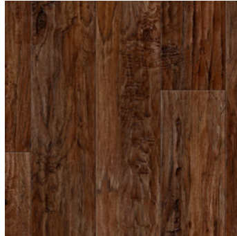
JAVA FAL24-T2345 47.24" x 39.37" Drop: 23.62"