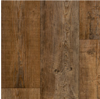
UMBER FAL24-T865 47.24" x 39.37" Drop: 23.62"