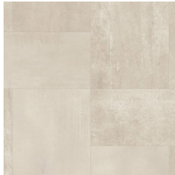
STONEY CREEK FAL24-RC532 78.74" x 39.37" Drop: 19.69"