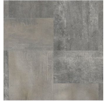
FOSSIL FAL24-RC573 78.74" x 39.37" Drop: 19.69"