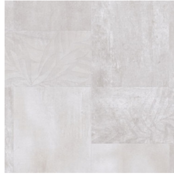
CLOUDY SKY FAL24-RC590 78.74" x 39.37" Drop: 19.69"