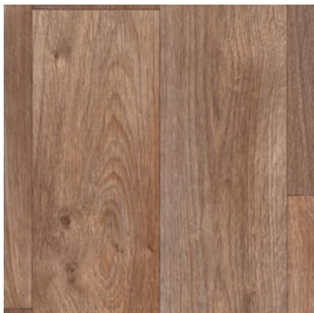
CARAVEL BROWN FAL24-TV786 39.37" x 39.17" Drop: 19.69"