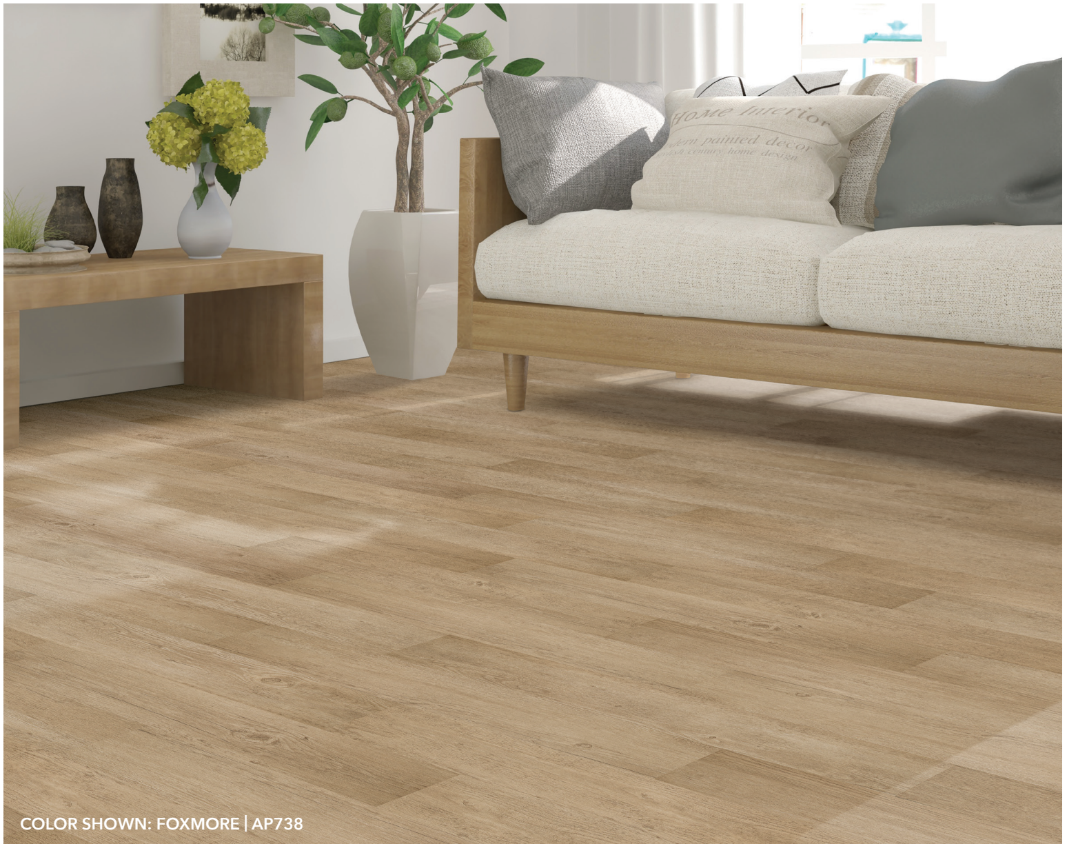
COLOR SHOWN: FOXMORE | AP738