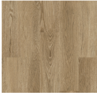
ROLLING HILLS CO746