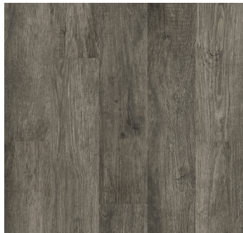
BURNING OAK WO795