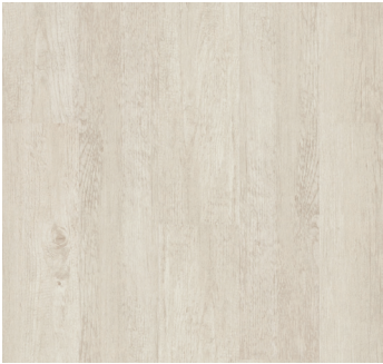
FLAT WHITE AP730