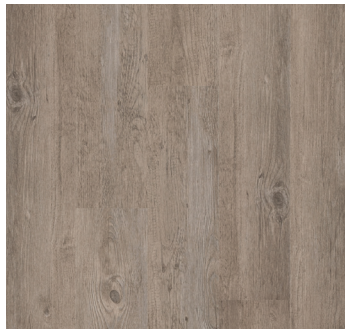
SIN LECHE AP749