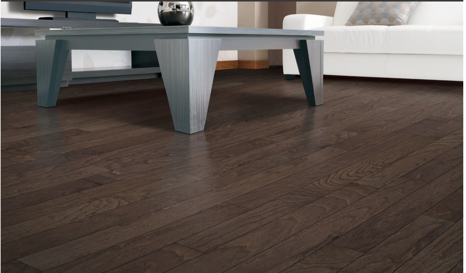
Cover: WOOL OAK MEC33-09