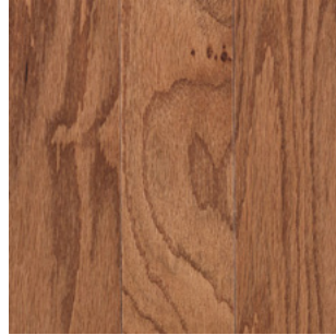
GOLDEN OAK 3" MEC33-20 5" MEC37-20