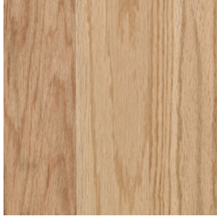
OAK NATURAL 3" MEC33-10 5" MEC37-10