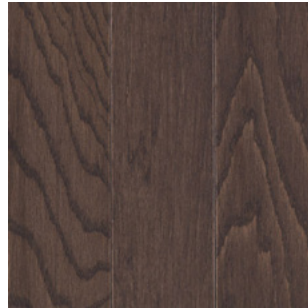
STONEWASH OAK 3" MEC33-17 5" MEC37-17