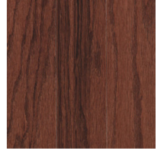
CHERRY OAK 3" MEC33-42 5" MEC37-42