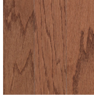
AUTUMN OAK 3" MEC33-30 5" MEC37-30