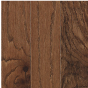
OXFORD OAK 3" MEC33-52 5" MEC37-52