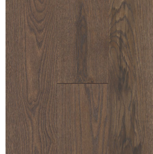
SACHEL OAK WEM02-35