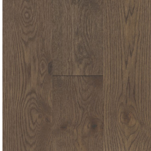
UMBER OAK WEM02-33