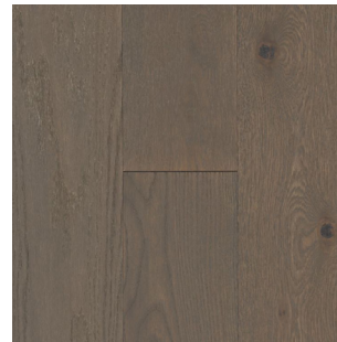
CREEK BEND OAK WEM02-39