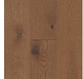
FIRESIDE OAK WEM02-36