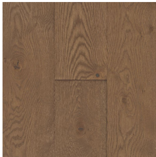
BLAZE OAK WEM02-37