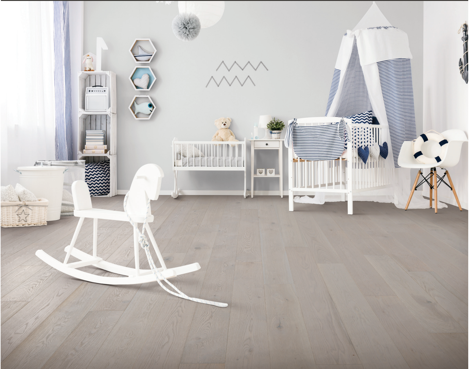
Above: WEM02-38 COVENTRY GRAY OAK