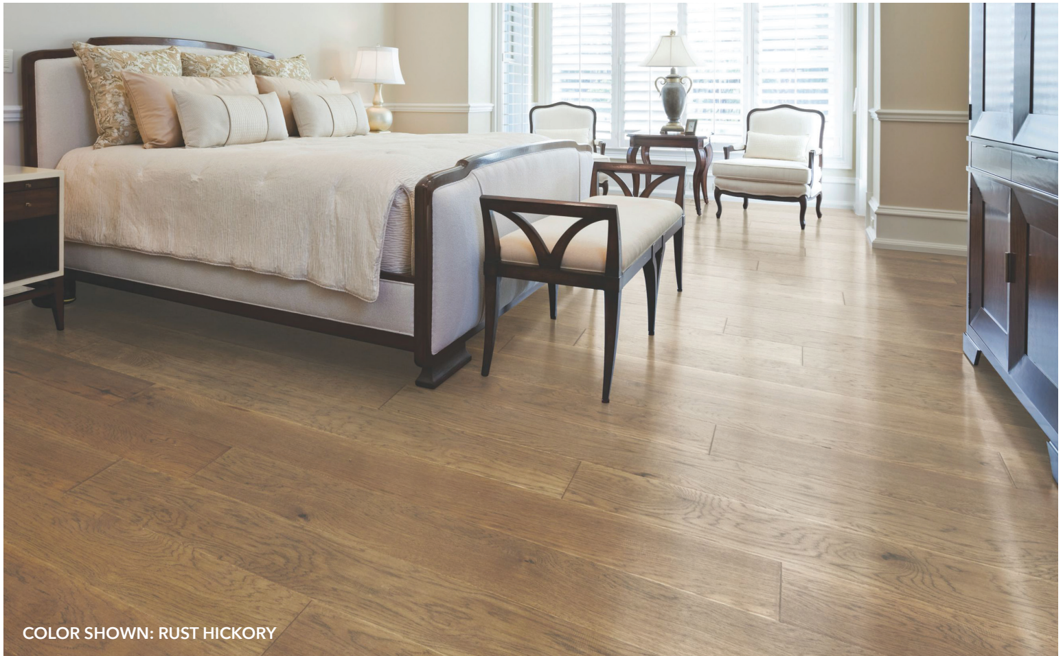
COLOR SHOWN: RUST HICKORY