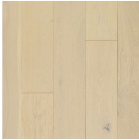
TIDAL OAK MEK43-01