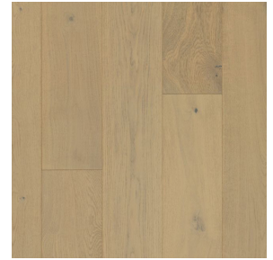
SCHOONER OAK MEK43-05