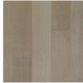
OYSTER OAK MEK43-04