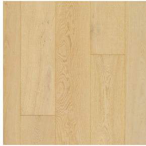
SANDCASTLE OAK MEK43-02