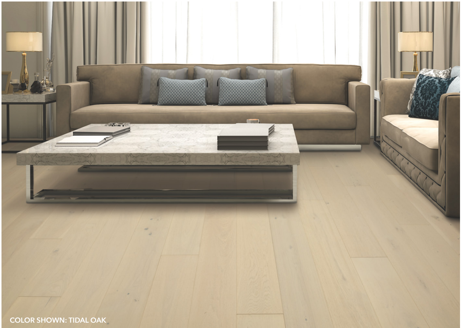
COLOR SHOWN: TIDAL OAK