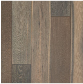
SILVER DOLLAR OAK MEK41-01