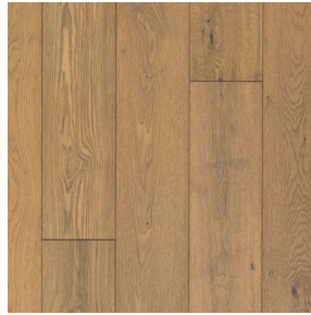
TOPSAIL OAK MEK41-03