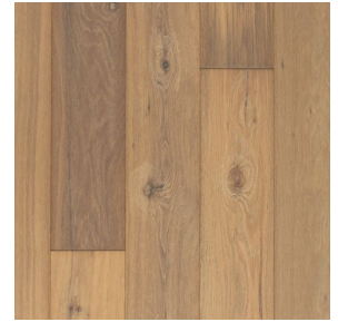
SANDBAR OAK MEK41-05