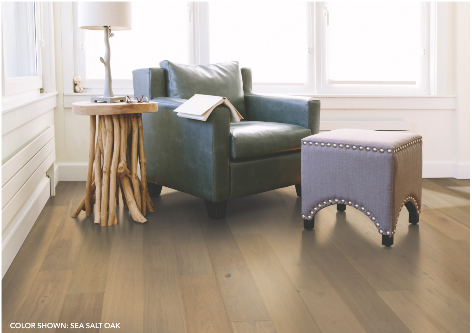
COLOR SHOWN: SEA SALT OAK